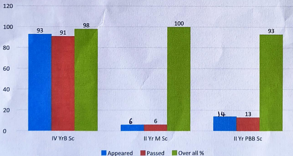
Examination Results 2022-23